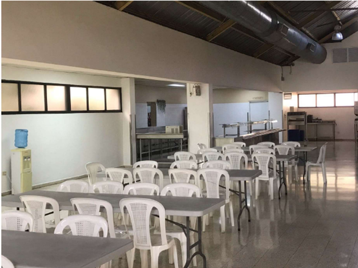
DINING ROOM FOR 120 ATHLETES